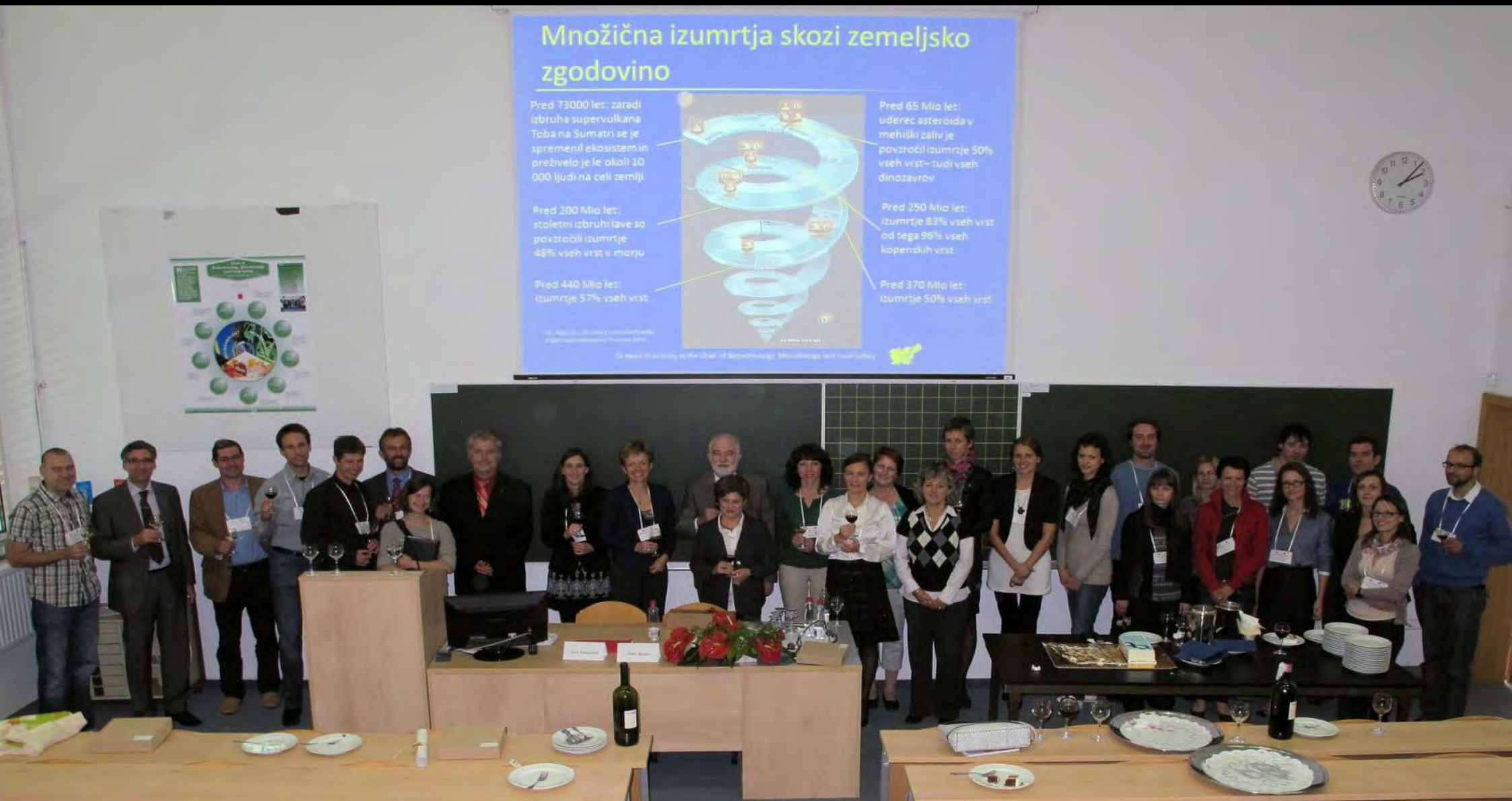
Photo after conference farewell cake party. 28.9.2012 at 14:06